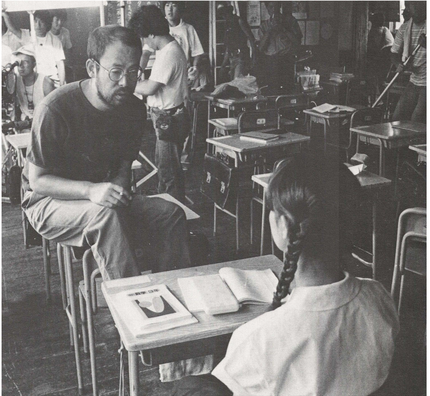
Shinji Somai directs Yuki Kudo in Typhoon Club .