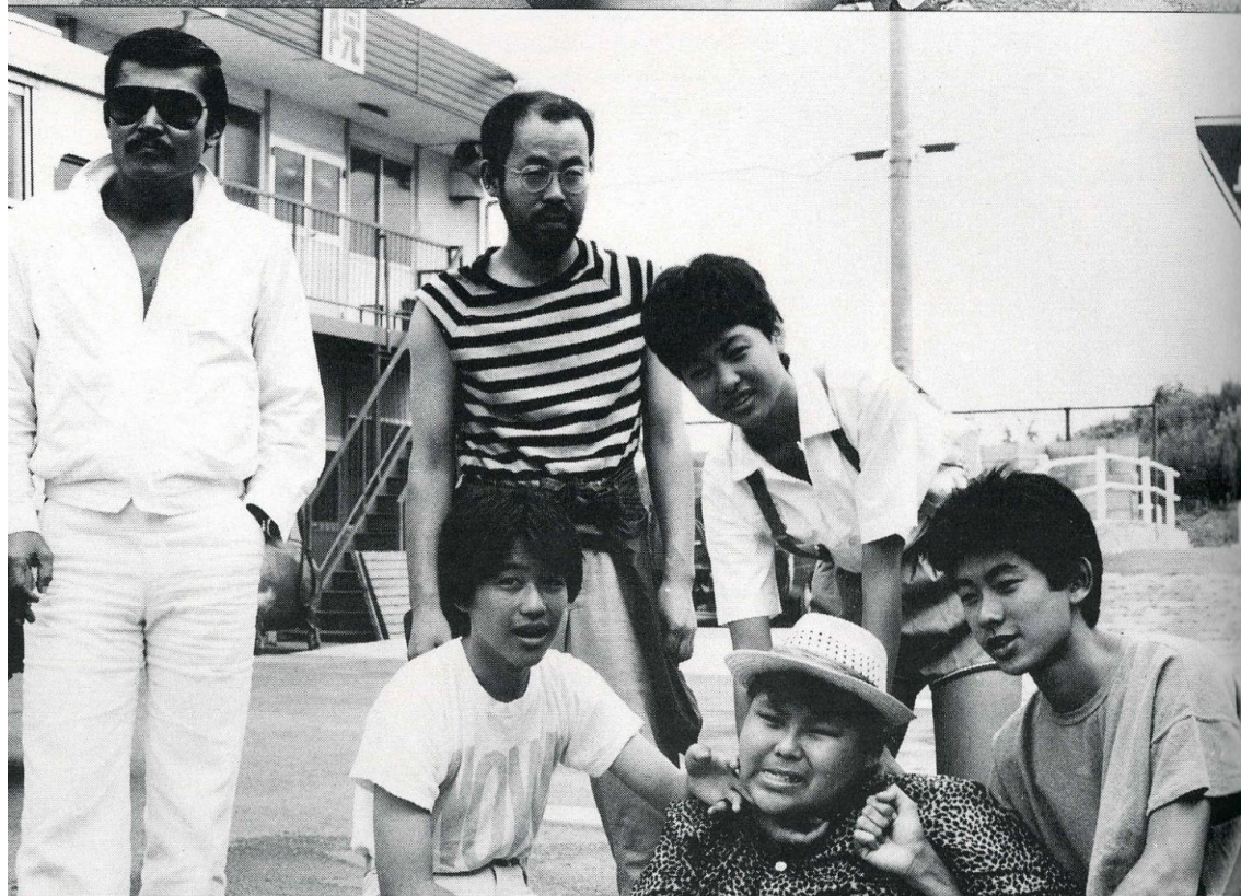
Director Shinji Somai with the cast of P.P. Rider .